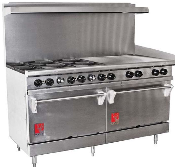
Model W60F-W1 shown with optional casters