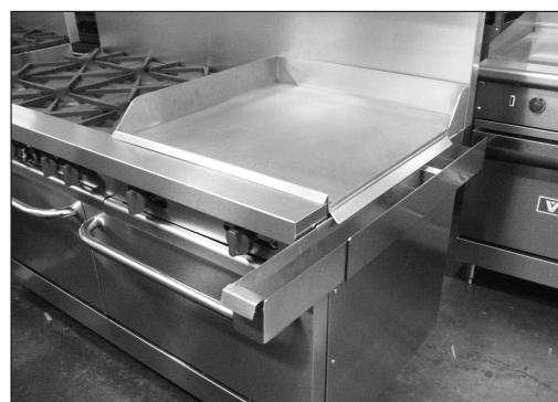
Side mounted grease trough