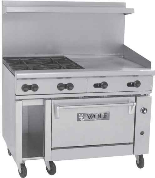
Model C48-S-4B-24G-N (Shown with optional casters)