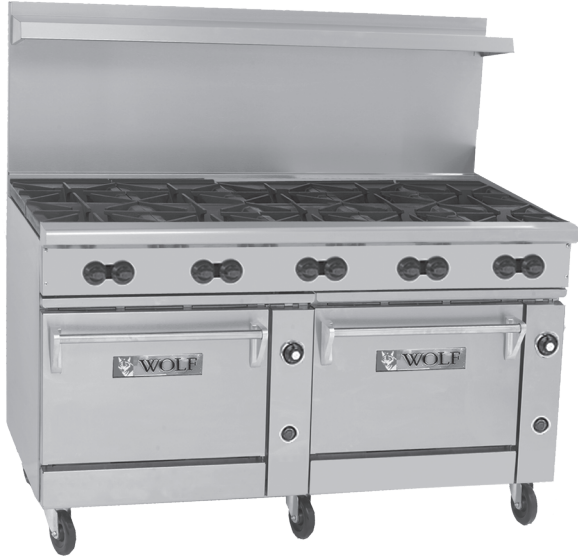
Model C60-SC-10B-N (Shown with optional casters)