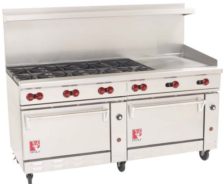
Model C72SS-8FT24 shown with optional casters