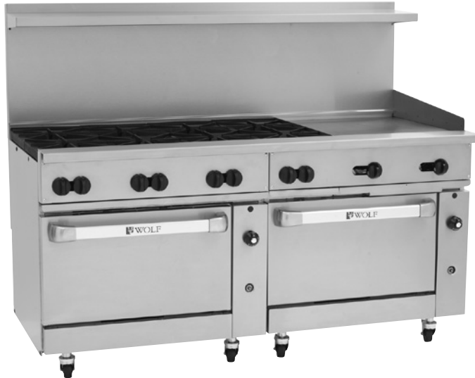
Model C72SC-8B-24G-N (shown with optional casters)

Connect-a-Range shipped in multiple cartons