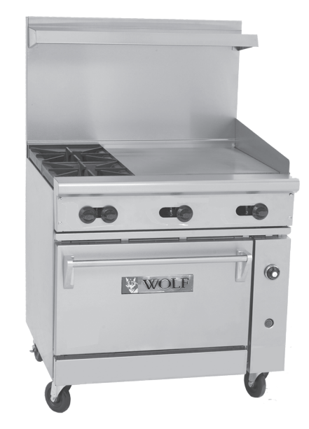
Model C36-S-2B-24G-N (Shown with optional casters)

2 OPEN BURNERS / 24" FRY TOP 36" WIDE GAS RANGE