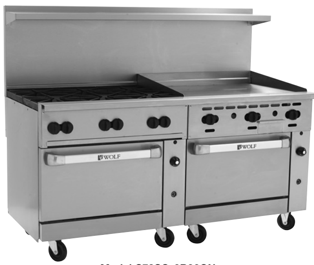
Model C72SC-6B36GN (shown with optional casters)

6 OPEN BURNERS / 36" GRIDDLE 72" WIDE GAS RANGE